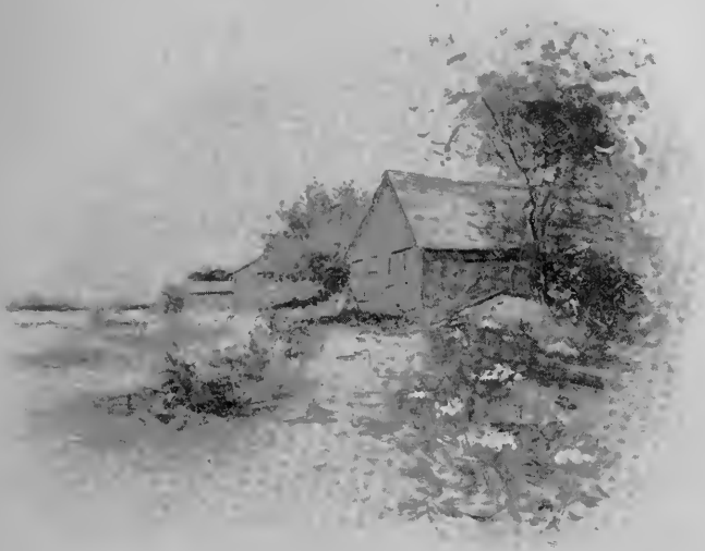
The Place of Dream